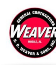
H.O. Weaver & Sons, Inc.