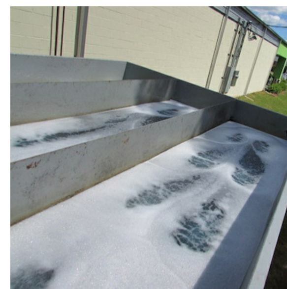
McFadden OxyShark® System